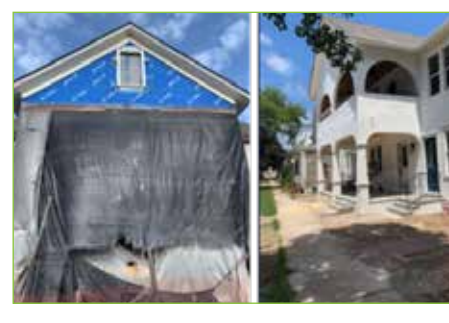
Facade Improvement Program: contributed over $1million in funding, prompting over $20 million in reconstruction