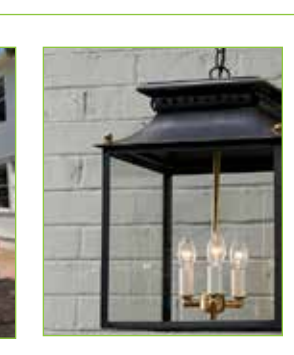
Lighting Project: building facade lighting for Chestertown's sidewalks at night