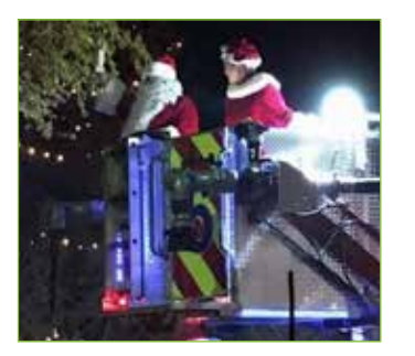
Hometown Holiday rings in the holiday season for Chestertown