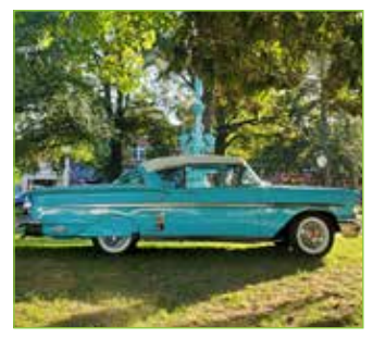
Chestertown Car Show , attracting car enthusiasts from all over the region