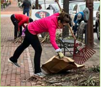
Tree well cleaning and other landscaping