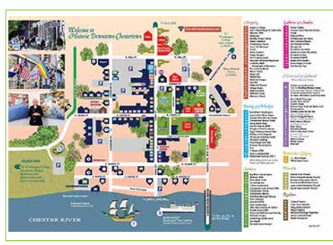
Visitors' Map & Event Guides, over 15,000 distributed regionally each year. Wall maps, to point visitors to Chestertown's businesses and attractions.