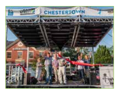
Main Street raised funds to buy an Events Stage used by many organizations for special events including festivals, graduations, and more.