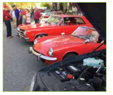
Cars on High , a monthly series featuring automotive prowess