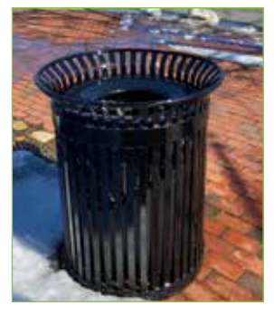
Purchased additional Trash & Recycling bins

Landscaping around plaque honoring Chestertown's African-American Slaves