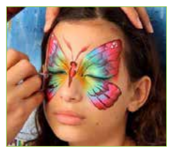
New this year! Carnival on High , a family friendly street carnival on July 4th weekend