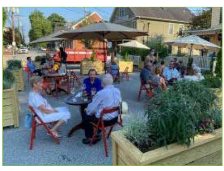
Planters create outdoor dining experiences and beautiful sidewalks

Landscaping around plaque honoring Chestertown's African-American Slaves